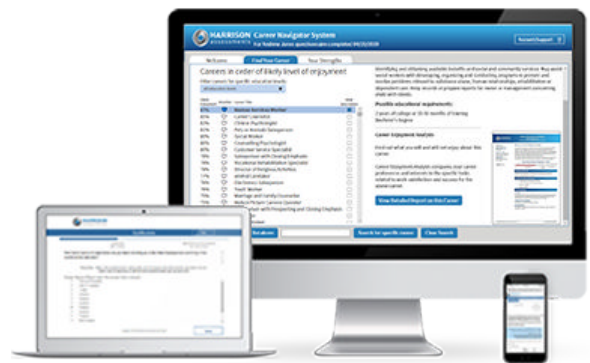
Online Interactive Career Portal